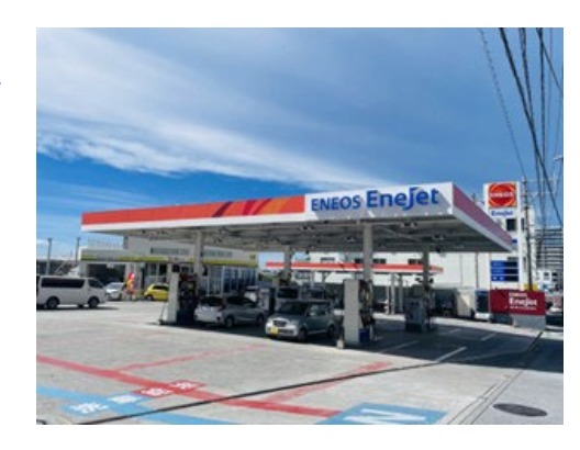
Car inspection and detailing service station, maehara

Air Conditioning Equipment Distribution (KHP)