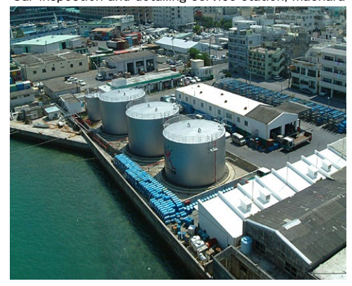
Naha Logistics Center