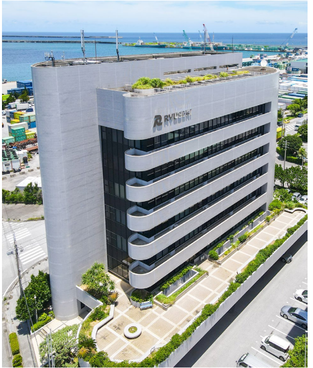
Bilding of Ryuseki