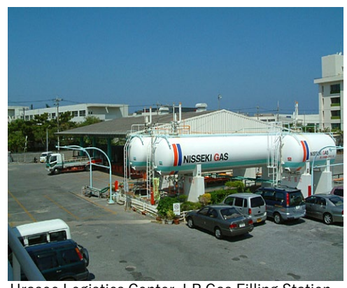
Urasoe Logistics Center, LP Gas Filling Station

[Business Outline] LP and LNG (liquid natural gas) Distribution / Fuel Containers and Gas-powered Appliances / Air-conditioning Equipment (Gas Heat Pump)