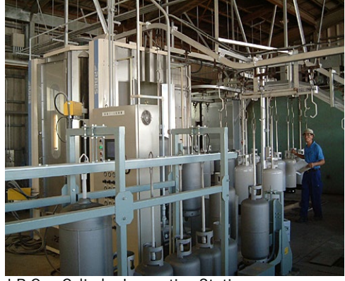
LP Gas Cylinder Inspection Station